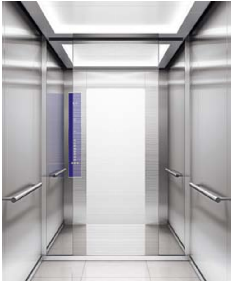
Ceiling LF104, ST4 & PP10 Walls ST13S, ST4, MP1 Handrail HR51S Floor M5