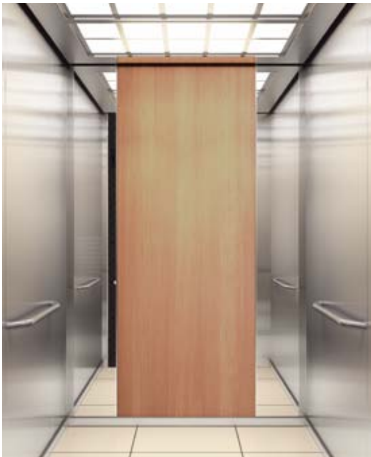
Ceiling LF70, ST4 Walls L9, ST4, MP1 Handrail HR54S Floor M7