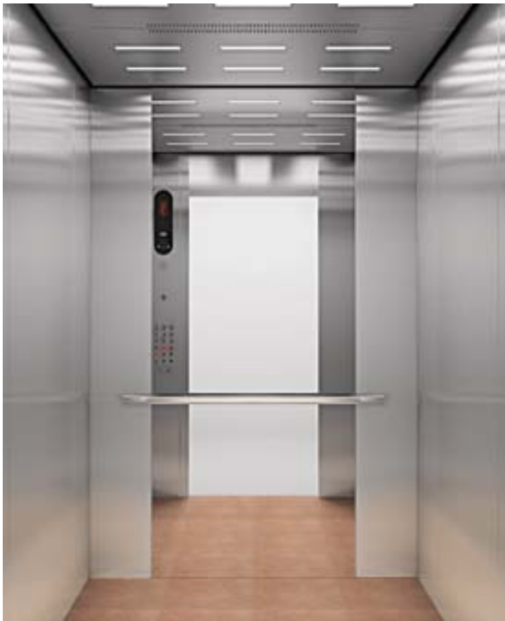
Ceiling LF103, ST4 Walls ST4, MP1 Handrail HR54S Floor D-21