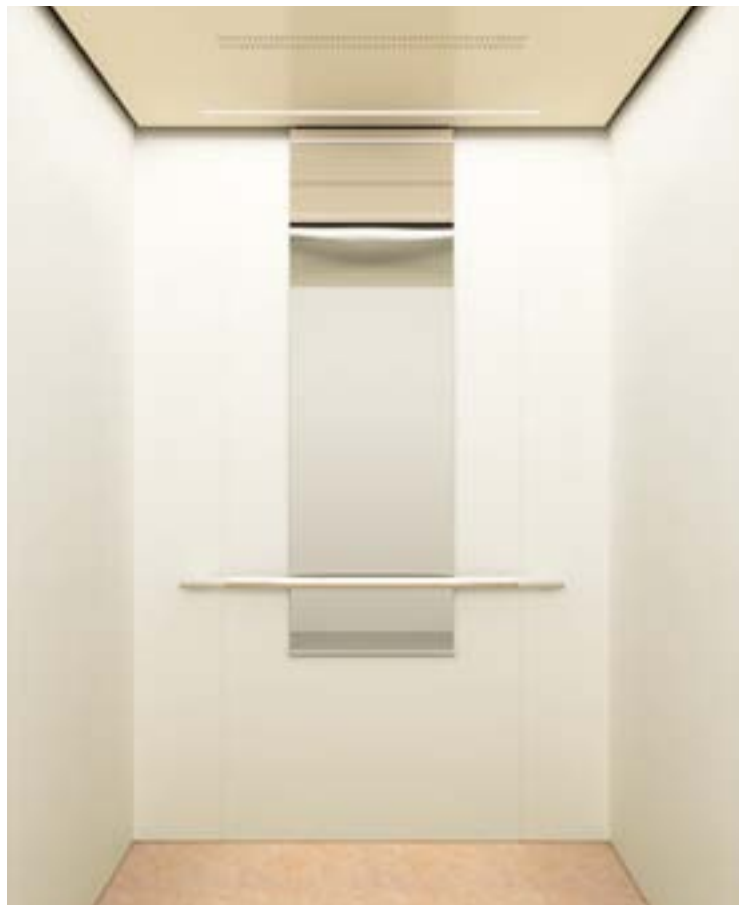
Ceiling LF94, PP18 Walls PP10 Mirror PH2 Handrail HR31AW Floor D-6