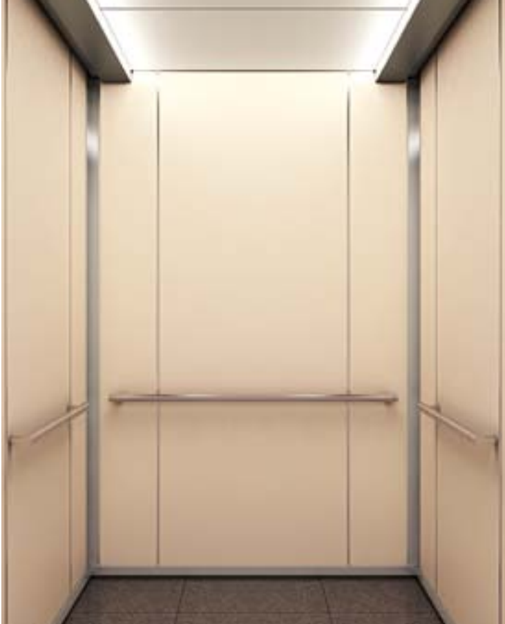
Ceiling LF95, ST4 & PP10 Walls L1 Handrail HR51S Floor M6