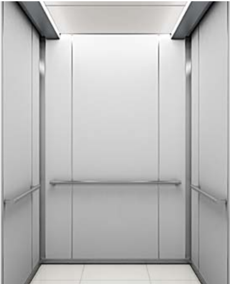
Ceiling LF95, ST4 & PP10 Walls L3 Handrail HR51S Floor M4