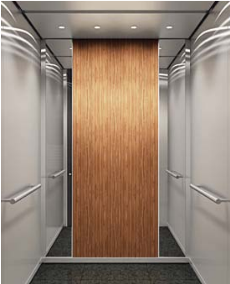
Ceiling LF88, ST4 Walls L8, ST4, MP1 Handrail HR51S Floor G2