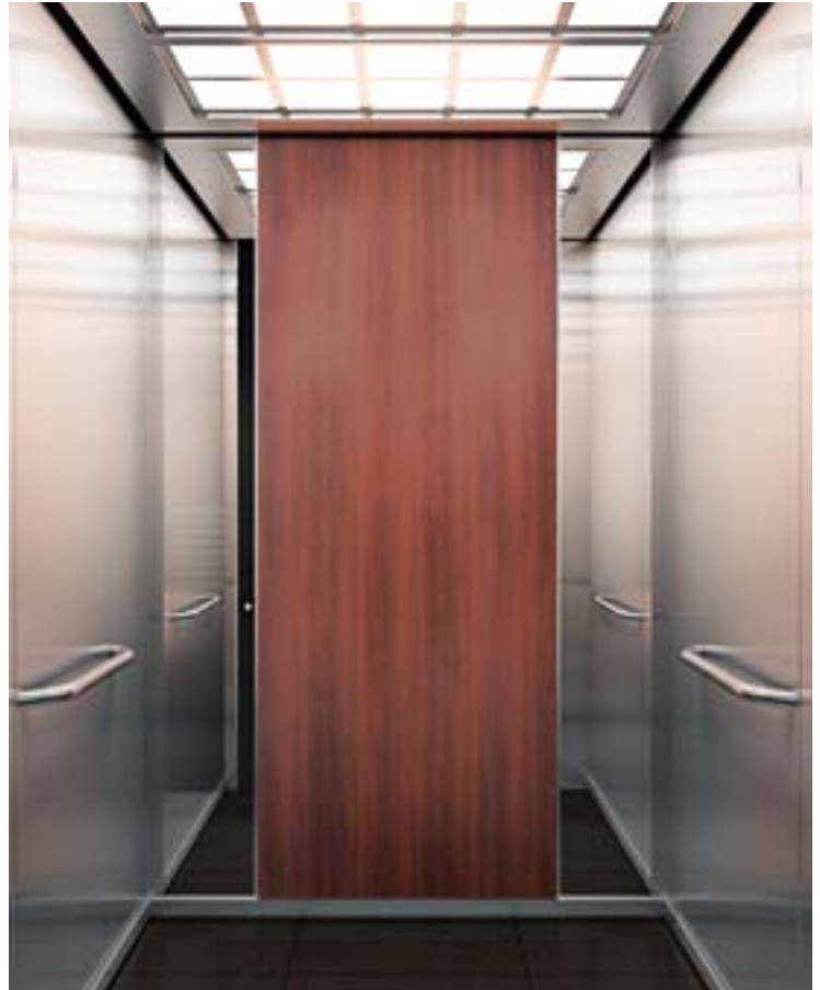
Ceiling LF70, ST4 Walls L7, ST4, MP1 Handrail HR54S Floor M3