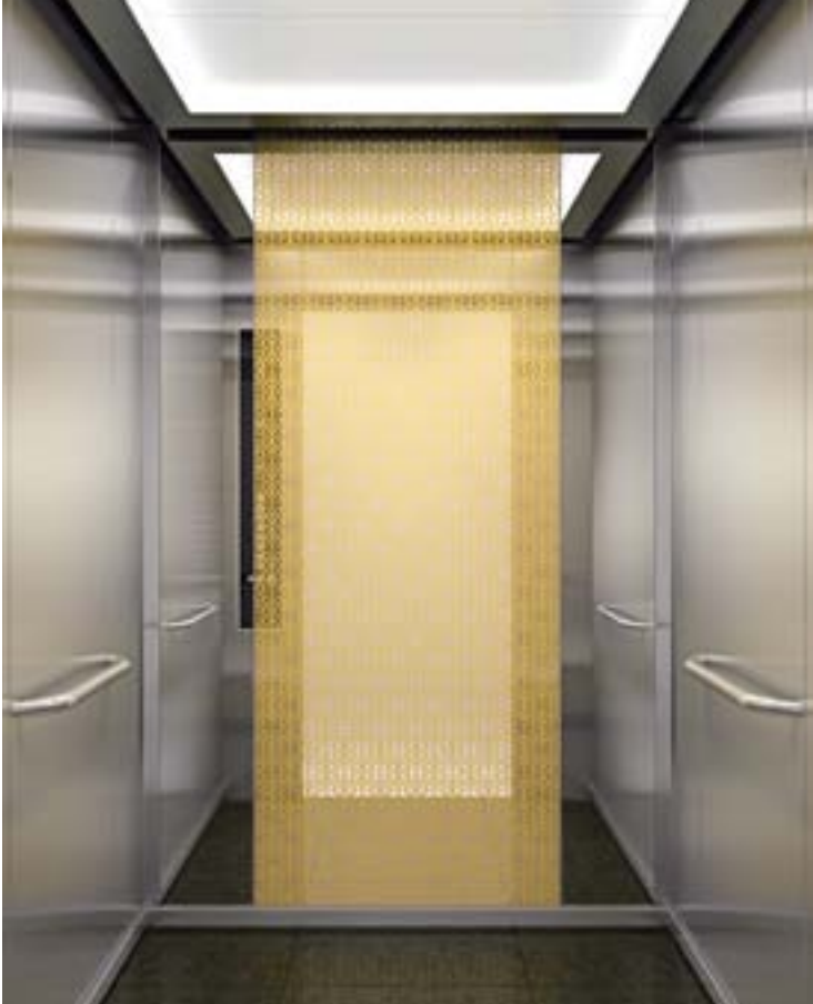
Ceiling LF104, ST4 & PP10 Walls ST29G, ST4, MP1 Handrail HR54S Floor G2