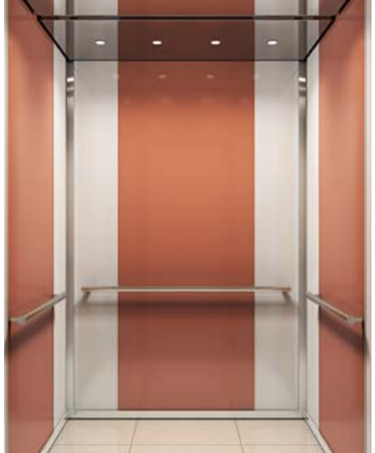
Ceiling LF88, MP1 Walls L2, L5 Handrail HR51S Floor M7