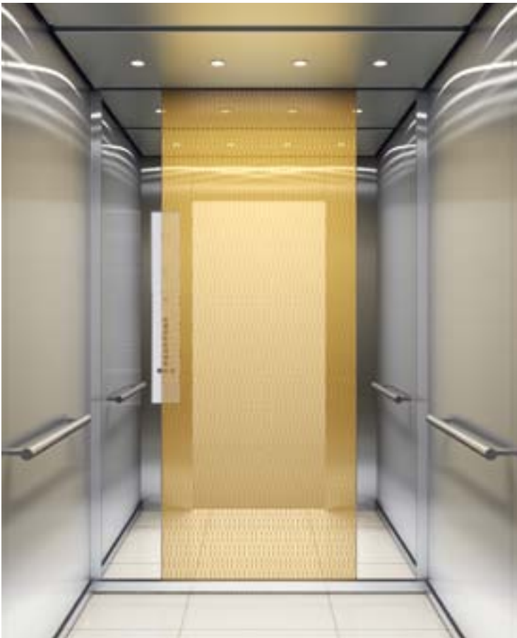
Ceiling LF88, ST4 Walls ST23G, ST4, MP1 Handrail HR51S Floor M4