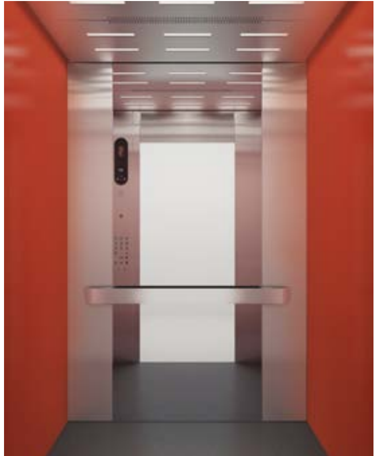
Ceiling LF103, ST4 Walls PP16, MP1 Handrail HR24R Floor D-12