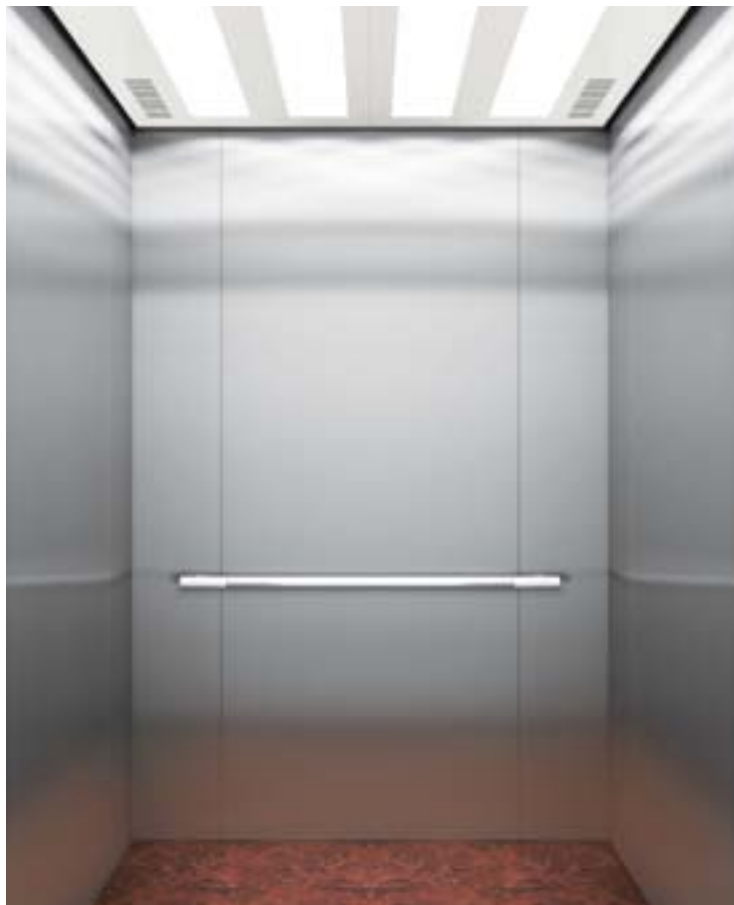
Ceiling LF66, PP10 Walls ST4 Handrail HR31AW Floor D-9