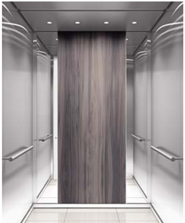
Ceiling LF88, ST4 Walls L6, ST4, MP1 Handrail HR51S Floor M4