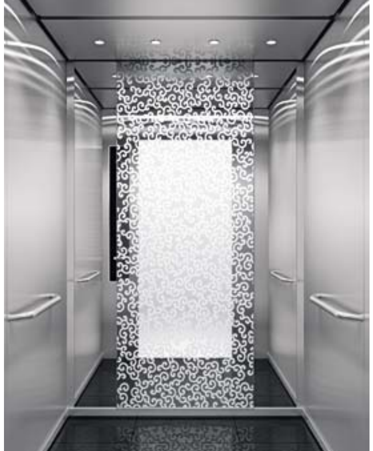
Ceiling LF88, ST4 Walls ST30S, ST4, MP1 Handrail HR54S Floor M3