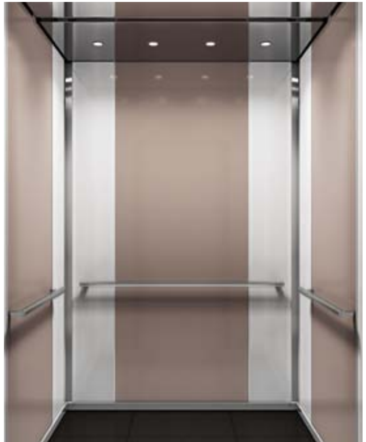
Ceiling LF88, MP1 Walls L4, L5 Handrail HR51S Floor M3