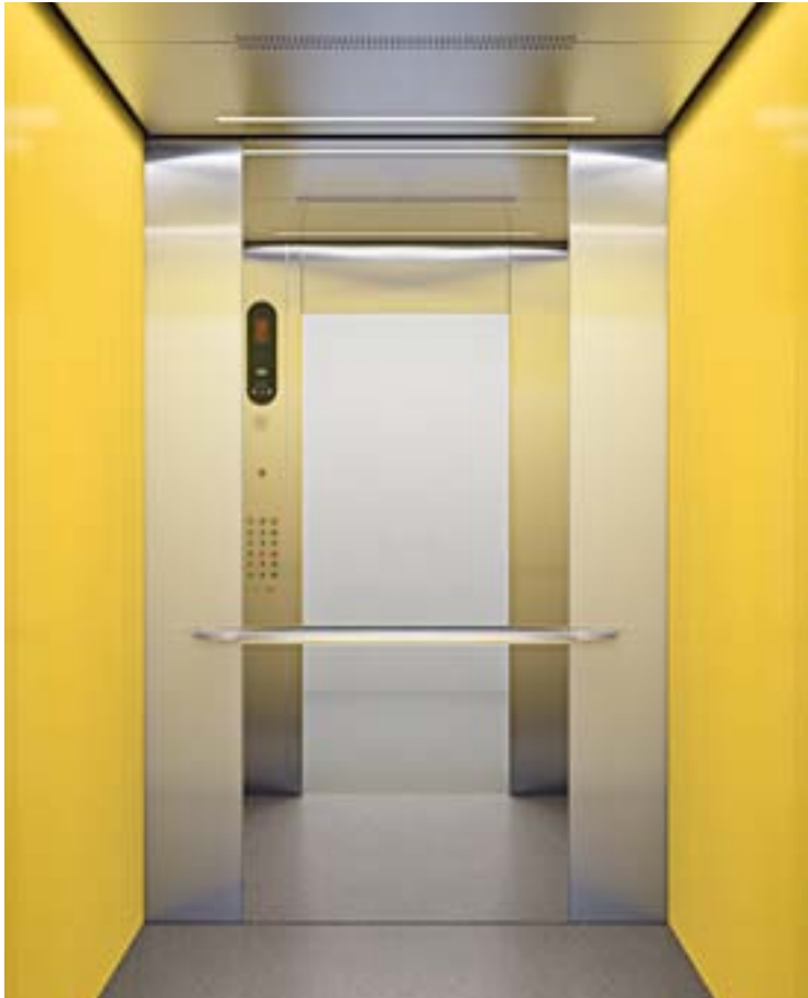
Ceiling LF94, ST4 Walls PP17, MP1 Handrail HR54S Floor D-22