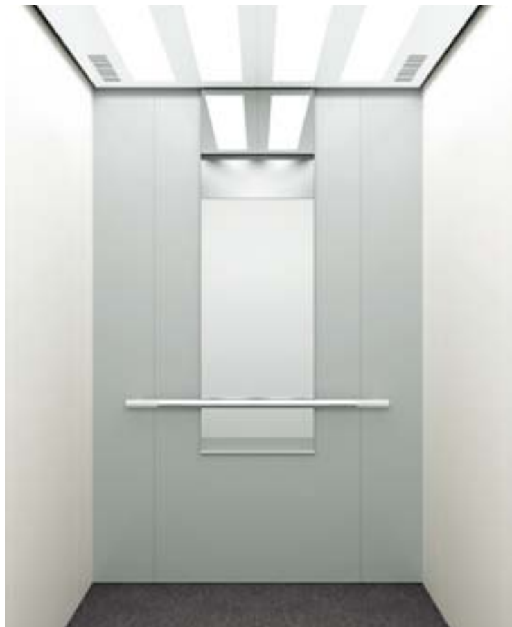
Ceiling LF66, PP10 Walls PP1, PP10 Mirror PH2 Handrail HR31AW Floor D-12