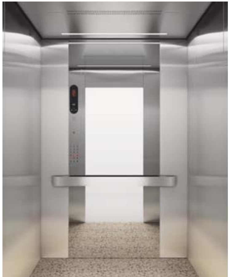
Ceiling LF94, ST4 Walls ST4, MP1 Handrail HR24R Floor D-20