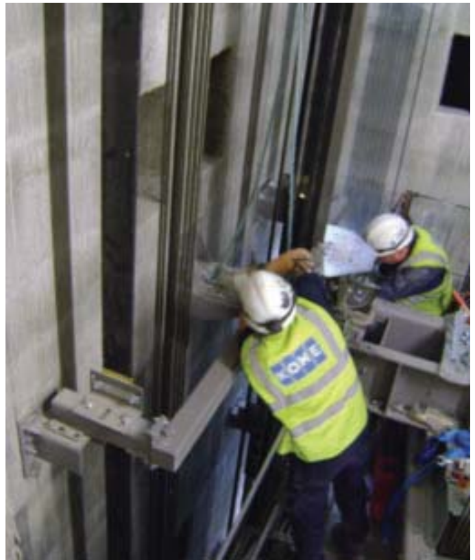
Lift shaft in the Shard