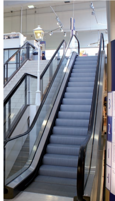
SOKOS LAHTI LAHTI, FINLAND

Scope 32 escalators and 4 ramps Construction / Modernization 2006 to 2010 Project type Full replacement