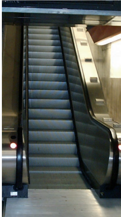
ROME UNDERGROUND AUTHORITY ROME, ITALY

Scope 4 elevators and 24 escalators Construction 2003-2007 Project type Full replacement