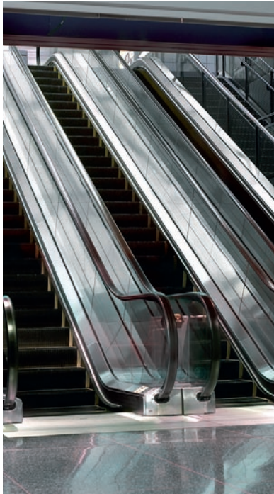
O'HARE INTERNATIONAL AIRPORT CHICAGO, ILLINOIS, USA

Scope 4 elevators and 24 escalators Construction 2003-2007 Project type Full replacement