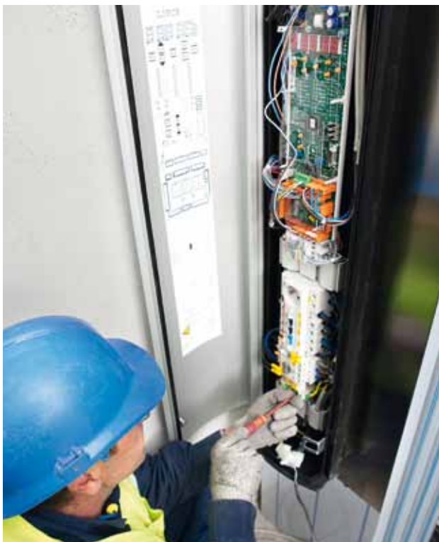
Our experienced modernisation teams make sure the job is completed on time and on budget.