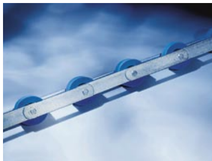
Lubrication free chain