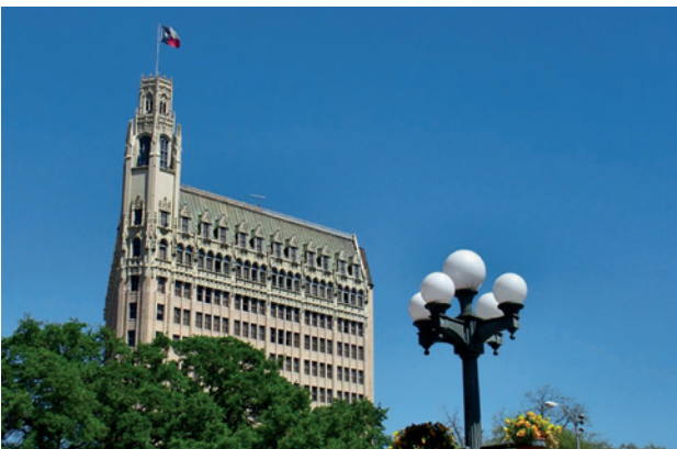
Emily Morgan Hotel, San Antonio, Texas, USA

KONE ReSolve™ with Unity Drive is a complete elevator drive and electrification solution for high-rise and high-performance modernization. The solution consists of KONE ReSolve™ electrification and drive system that utilizes the latest and leading technology in the DC-drive segment. KONE ReSolve™ with Unity Drive, with rated speeds up to 7 m/s, provides high performance with low energy consumption and low harmonic distortion.