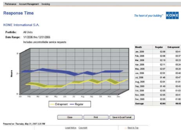
Response Time graph

You can see at a glance the equipment availability and the time it took to respond to service requests, in both regular and entrapment situations.