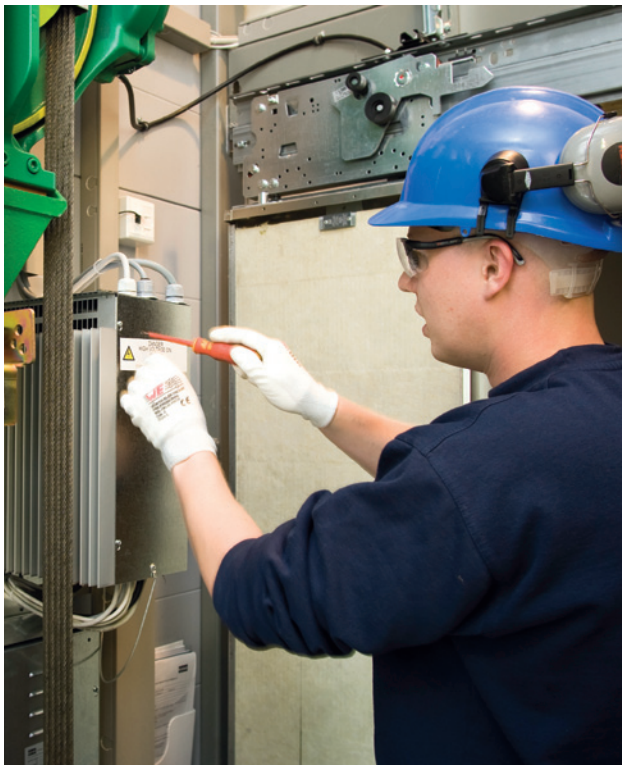
Our experienced modernization teams make sure the job is completed on time and on budget.