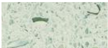
Bianco Perla (SF5)