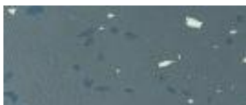
Dayton Grey (RC9)