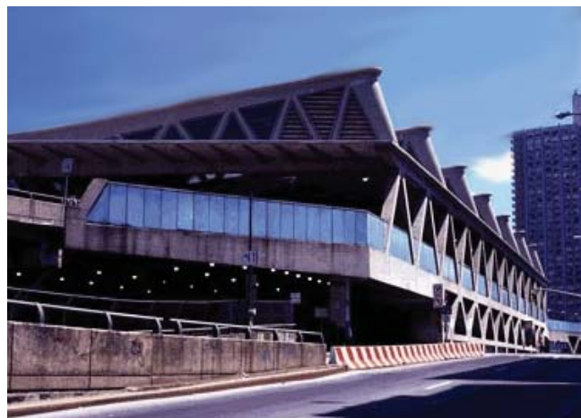
George Washington Bridge Bus Station

Rehabilitation involved removing major components of an escalator, replacing them with new or reconditioned parts, and reconditioning the driving machine — keeping only the original outer shell and truss. Since the existing escalators were of a 1960 design, the replacement parts were difficult to obtain. Some were no longer available from the original manufacturer